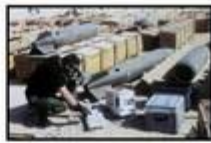
Iraqi 500-gauge chemical bombs.