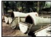
Iraqi Al-Husayn chemical warheads.