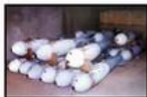
Iraqi RI-400 chemical bombs.