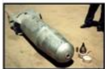
Iraqi DB-2 chemical bomb.