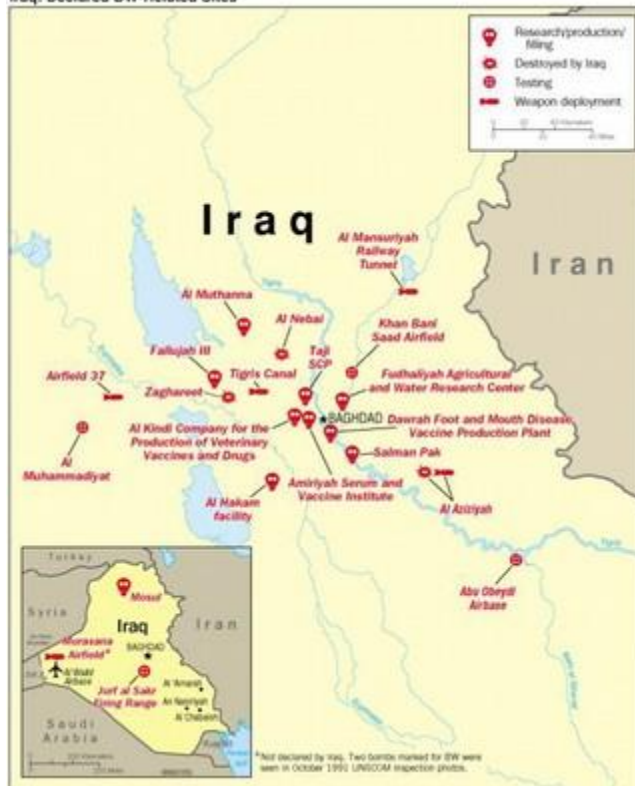
Iraq: Declared BW-Related Sites