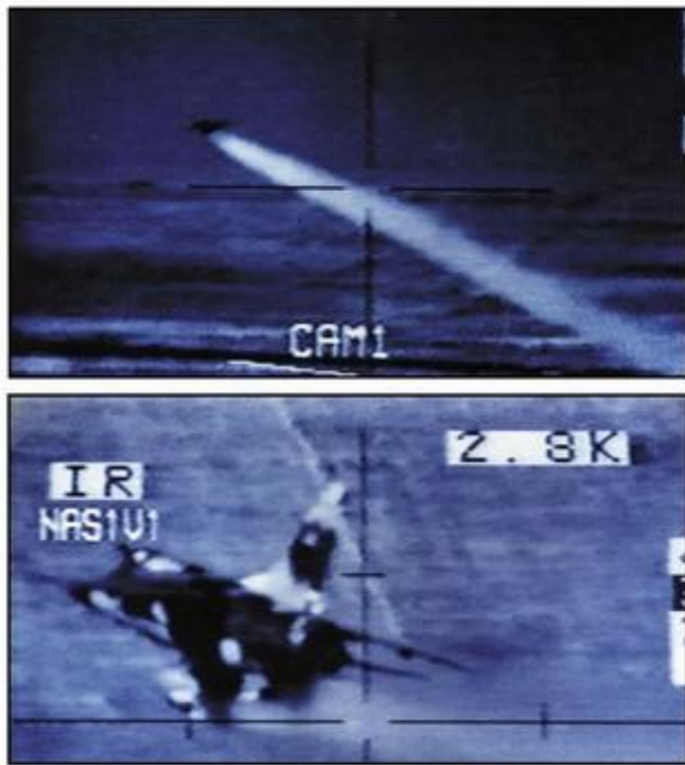
Test of dissemination of BW agents from a modified drop tank carried by a Mirage F1. The drop tank was filled with 1000 liters of slurry Bacillus subtilis, a simulant for B. anthracis, and disseminated over Abu Obeyd Airbase in January 1991. The photo is from a videotape provided by Iraq to UNSCOM.