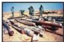
122-mm rockets filled with the chemical nerve agent sarin prior to destruction.

Although precise information is lacking, human rights organizations have received plausible