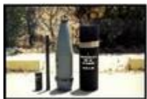
Iraqi 155-mm chemical shell.