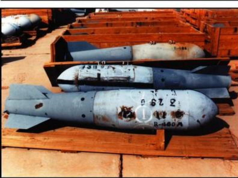
Two R-400A bombs in foreground photographed by UNSCOM inspectors at Murasana Airfield near the Al Walid Airbase in late 1991 bear markings indicating they were to be filled with botulinum toxin. Other bombs appear to have markings consistent with binary chemical agent fill. This evidence contradicted Iraq's declarations that it did not deploy BW munitions to operational airbases and that it destroyed all BW bombs in July 1991—declarations that were subsequently retracted in the face of overwhelming evidence to the contrary.

After four years of claiming that they had conducted only "small-scale, defensive" research, Iraqi officials finally admitted to inspectors in 1995 to production and weaponization of biological agents. The Iraqis admitted this only after being faced with evidence of their procurement of a large volume of growth media and the defection of Husayn Kamil, former director of Iraq's military industries.