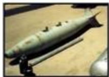
Iraqi 250-gauge chemical bomb.